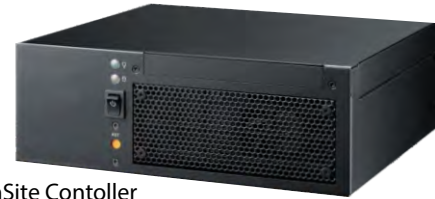
HALO OnSite Controller