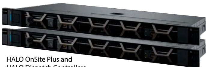
HALO OnSite Plus and HALO Dispatch Controllers

HALO OnSite Plus supports all the features of HALO OnSite and supports an unlimited number of users. HALO OnSite Plus also adds HALO Dispatch, a web-based location tracking and group calling dispatch application (which requires a HALO Dispatch controller). HALO OnSite Plus also supports user-initiated video calls using video-capable PoC devices.