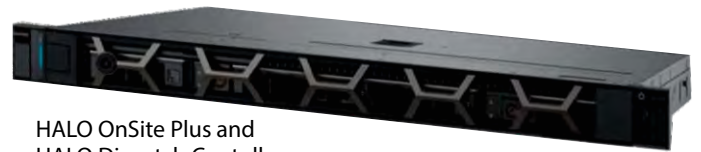
HALO OnSite Plus and HALO Dispatch Controller