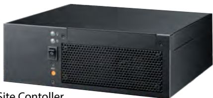
HALO OnSite Controller

HALO OnSite is a low-cost, entry-level system. HALO OnSite supports Wi-Fi and 4G/LTE network access, up to 200 users, group voice calling, and text messaging.