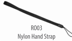
R003 Nylon Hand Strap