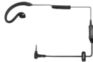
EHS30 C-Style Earpiece with in-line PTT