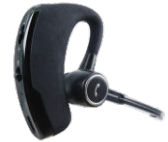
EHW08 Bluetooth Earpiece with PTT Button and Mic