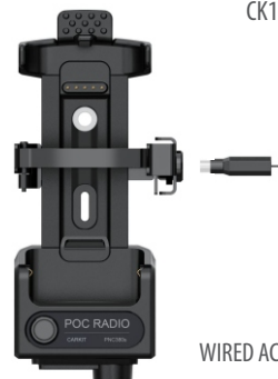
CK10 CAR KIT

The CK10 Car Kit is a rugged vehicle mounting assembly that enables the PNC380S to be installed on a vehicle dashboard and comply with DOT safety requirements. The Car Kit allows the PNC380S to be easily removed for handheld job-site communications. It includes a locking bracket, an on/off power button, and ports for external speakers, microphones, and push-to-talk buttons. The Car Kit also functions as a docking charger for the PNC380S.